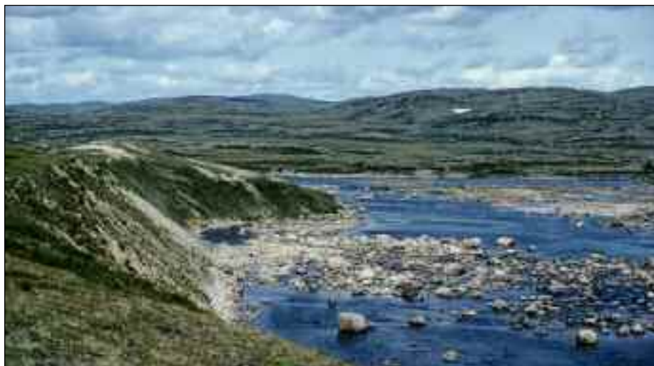
A rocky stream bed near the height of land.

route and went over the northern flank of Mont Tshiasketnau. Although it was longer than our first route (about 8 km vs. 6 km to get to the next lake), it was mostly in open country. The scenery was stunning, with views of the lake far below and boulder fields and ponds ahead of us. I had rather fond memories of this portage until I viewed Dick's videos of the trip a couple of years ago while I was helping digitize his VHS footage. The scenes gave me a clearer glimpse of what the portage