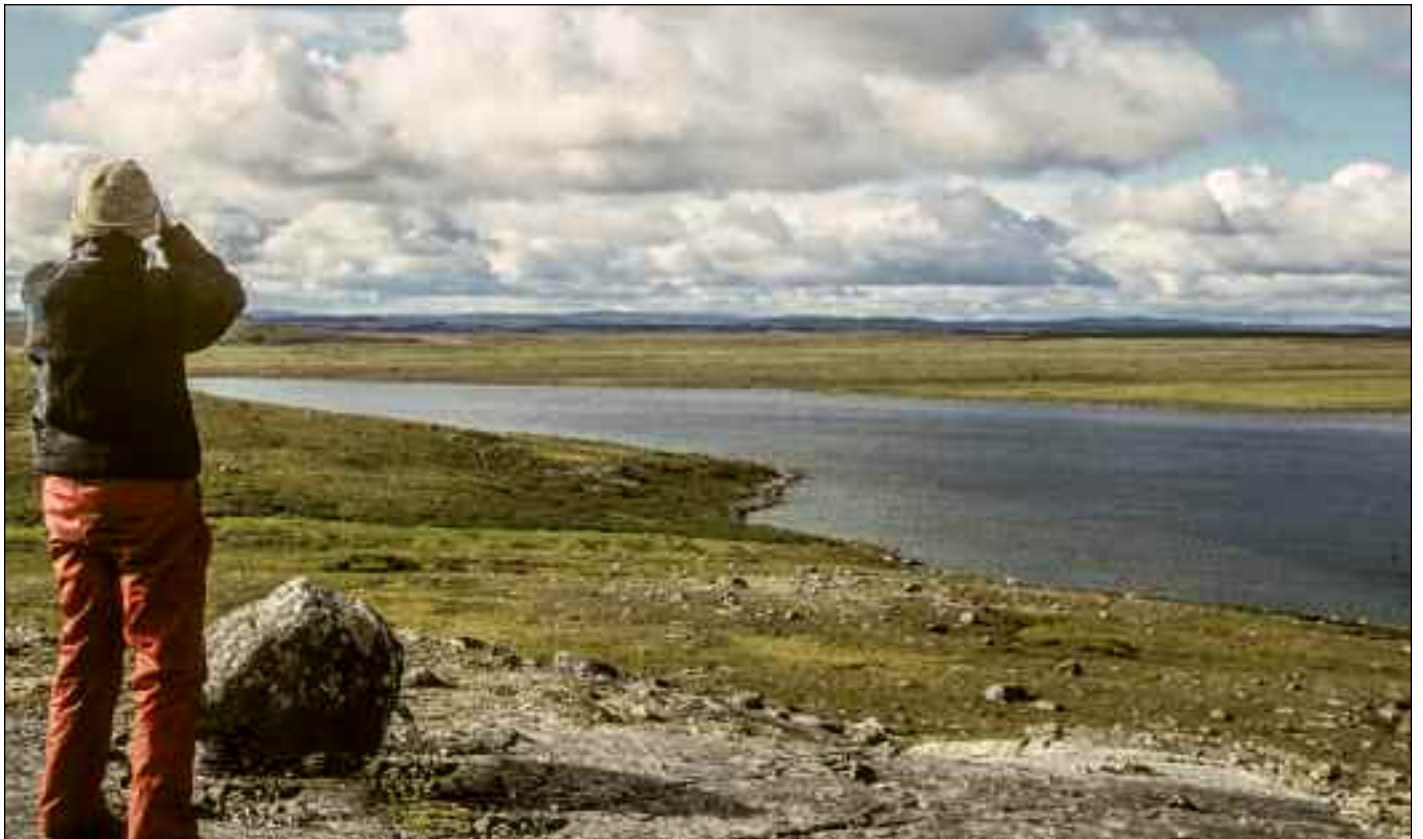
An expansion on the northern tributary.