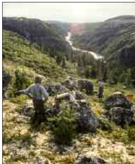
Starting our descent to the Kogaluk from the north rim.