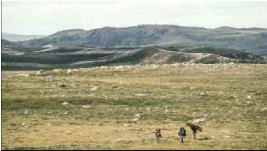
Pond hopping as we approach toward the northern tributary.

Dave, Dick and I paddled up the coast, spending about three more days on the water. We camped on some of the many islands on the journey to Nain and enjoyed paddling amidst the wildly beautiful scenery. We've traveled many miles on the northern Labrador coast and have always felt lucky to be able to go to such wild places. We paid careful attention to the weather, left plenty of time to be wind-bound and carried some fresh water in case we had to rush to shore quickly. One night on the way to Nain, we collected rainwater running from the tarp to use for cooking because there was no easily accessible stream nearby. Once one got past the smoky taste picked up from the tarp, it wasn't too bad.