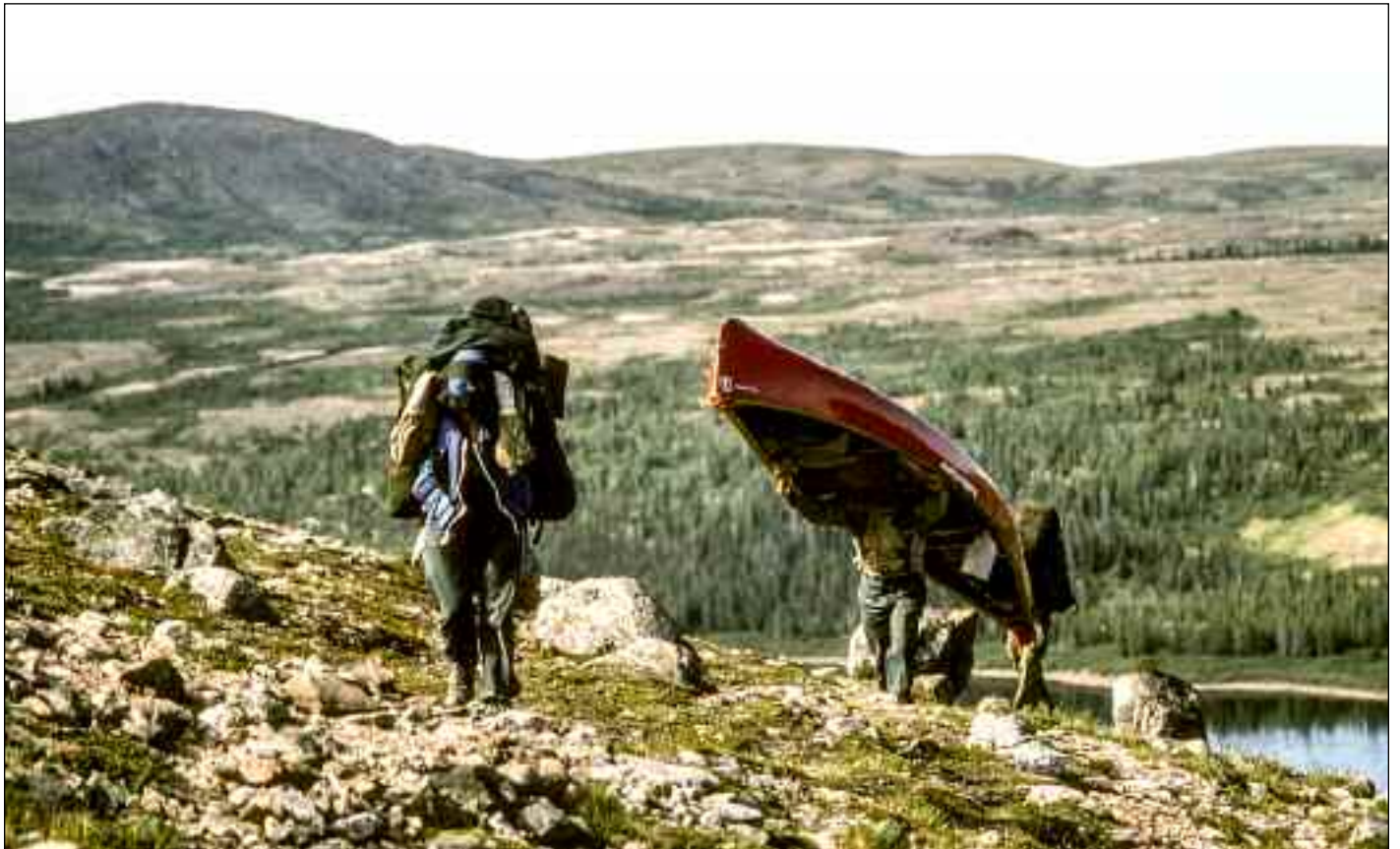
Climbing up from Indian House Lake.

Quarterly Journal of the Wilderness Canoe Association