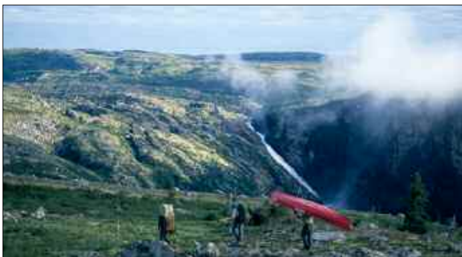
On the south rim of the Kogaluk.