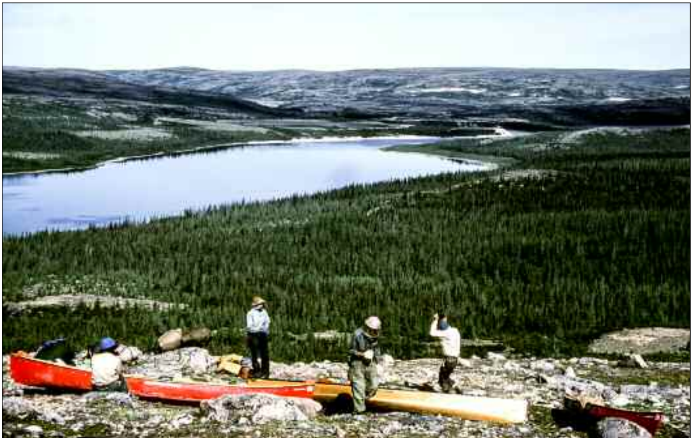
A rest stop on our portage out of Indian House Lake.