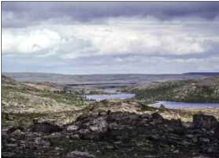
A vista north of Hawk Lake.