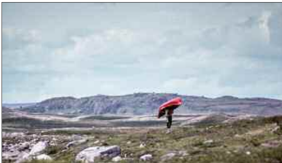
Dave heading overland.

was really like and offered a lesson on how memory can soften events. I concluded that the portage might have been very enjoyable if not for the steep climb, the black flies, the oppressive heat and the heavy loads.