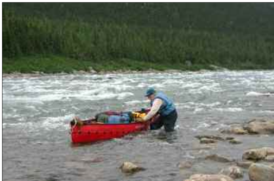
Wading in shallow rapids on the Koroc River.