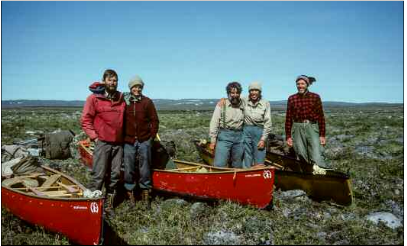
"This unprepossessing piece of land..." On the Quebec/Labrador border.