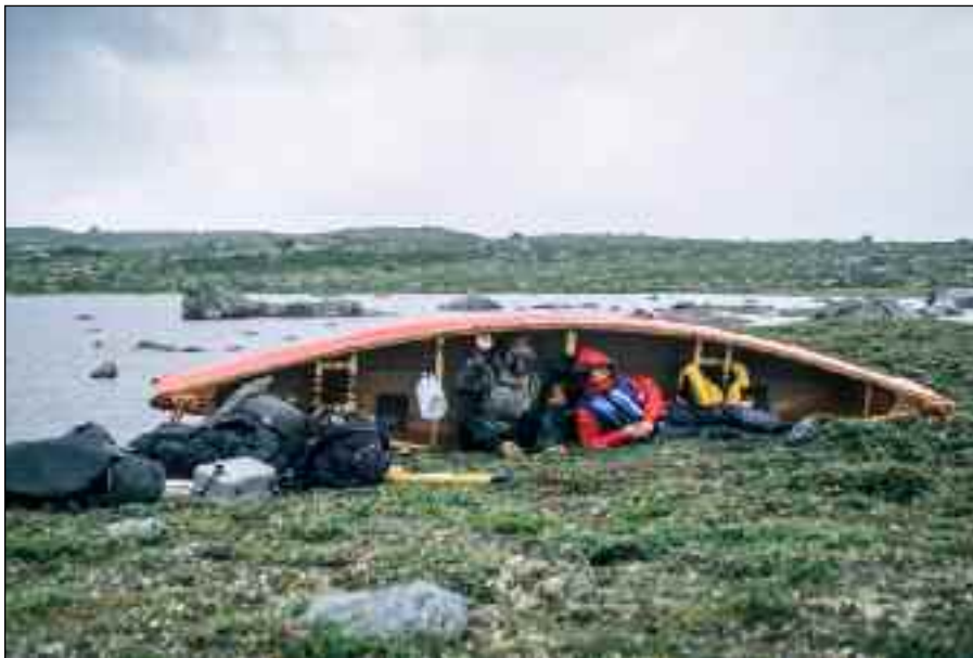
Huddling under the canoe for protection from the hailstorm.