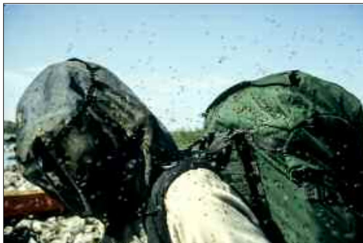
Wendy and black flies north of Lake Mistinibi.