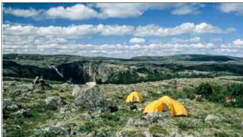
South rim campsite.

into the southwestern arm of Mistinibi. From Mistinibi, we followed our portage route from 1992 through Hawk Lake to the southern rim of the Kogaluk canyon.