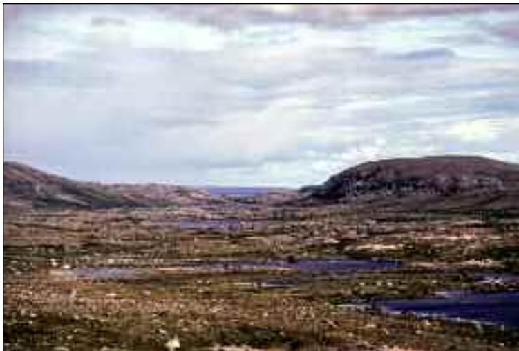
A maze of ponds and rock on the barrens.