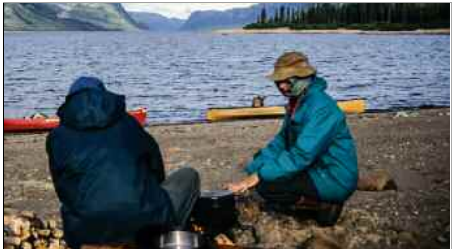
On Cabot Lake.