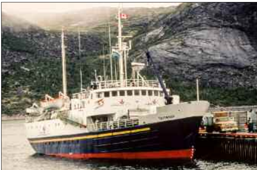
The Taverner in Nain.