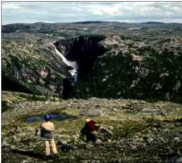
Taken from the south rim, our first view of the northern tributary.