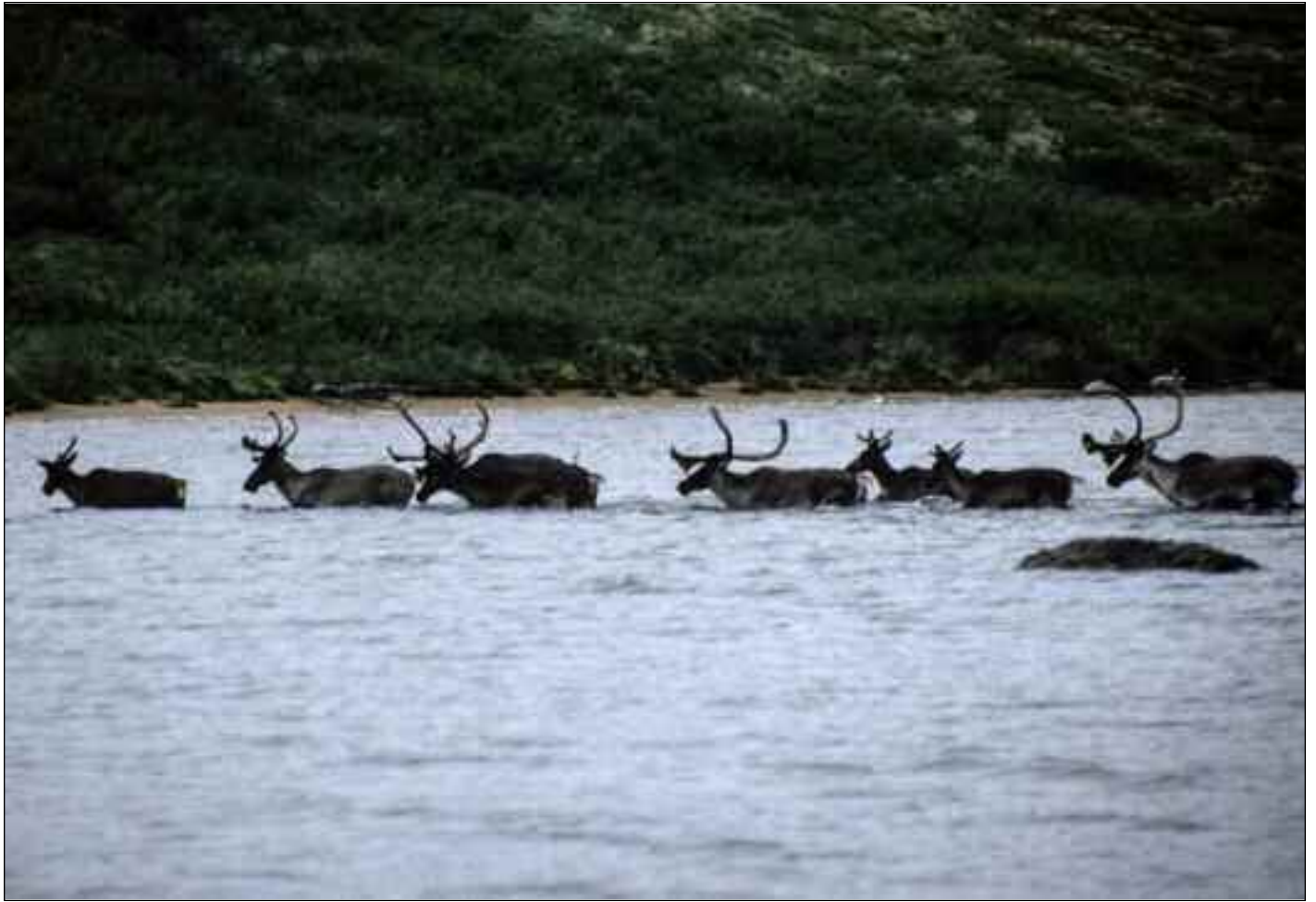
Caribou crossing a narrows on Mistinibi Lake.