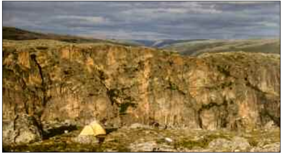
North rim campsite.