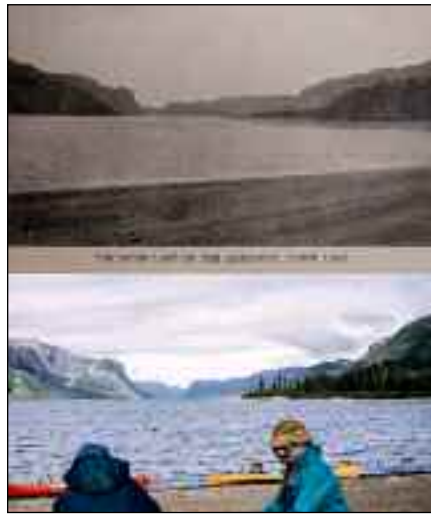
Cabot Lake Pictures.

mostly as a badly-needed source of jobs and wealth for the region or mourns the loss of a magnificent, pristine area, the area will be profoundly changed.