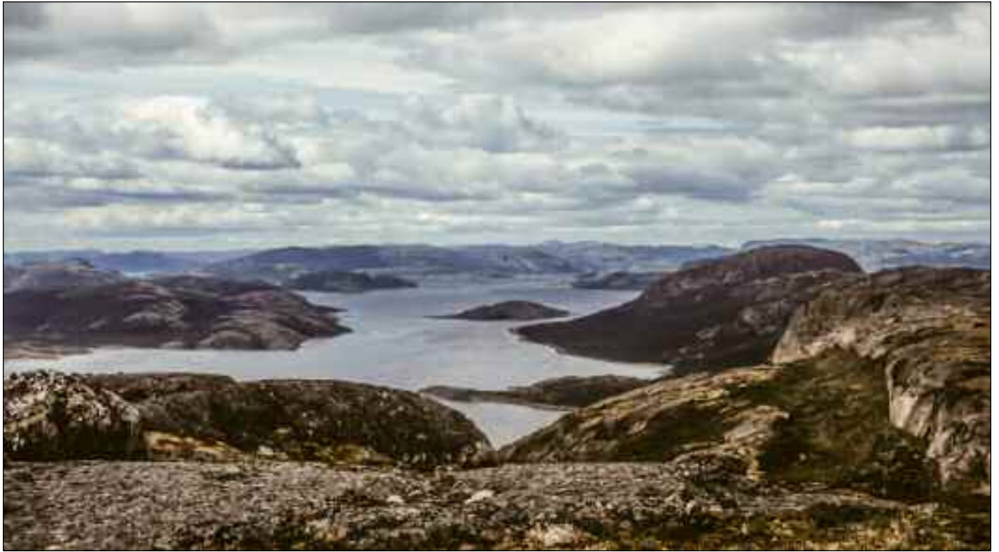
View from an island in the Labrador Sea on the way to Nain.