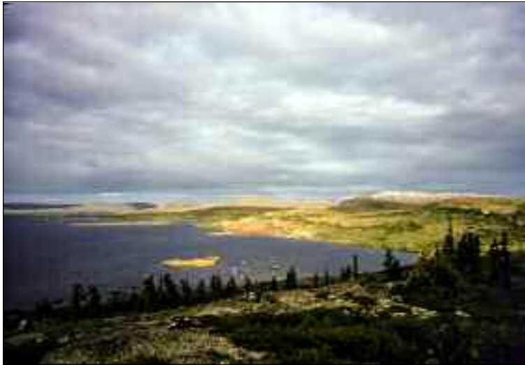
Sunrise on Hawk Lake.